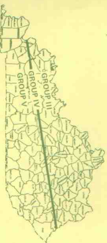
Approximate areas of adaptation of the maturity groups commonly grown in Kentucky.

Early-maturing varieties (Group III), such as Calland and Williams, are best adapted in areas of Kentucky north of the line indicated on the map shown below. The line is approximately the same as where the Western Kentucky Parkway is located. Late-maturing varieties (Groups V and VI), such as Dare, York and Forrest are best adapted in areas south of the indicated line. Mid-season varieties (Group IV), such as Cutler 71, Custer and Kent, can be successfully grown in most areas in Kentucky.*