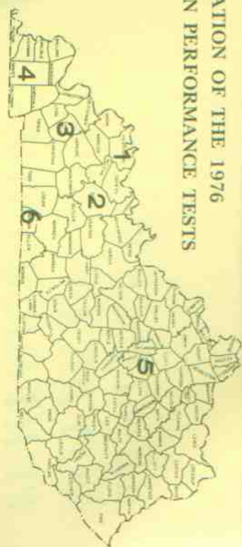
Table 1.—Location, Planting Data and Climatic Data for the 1976 Soybean Performance Tests.